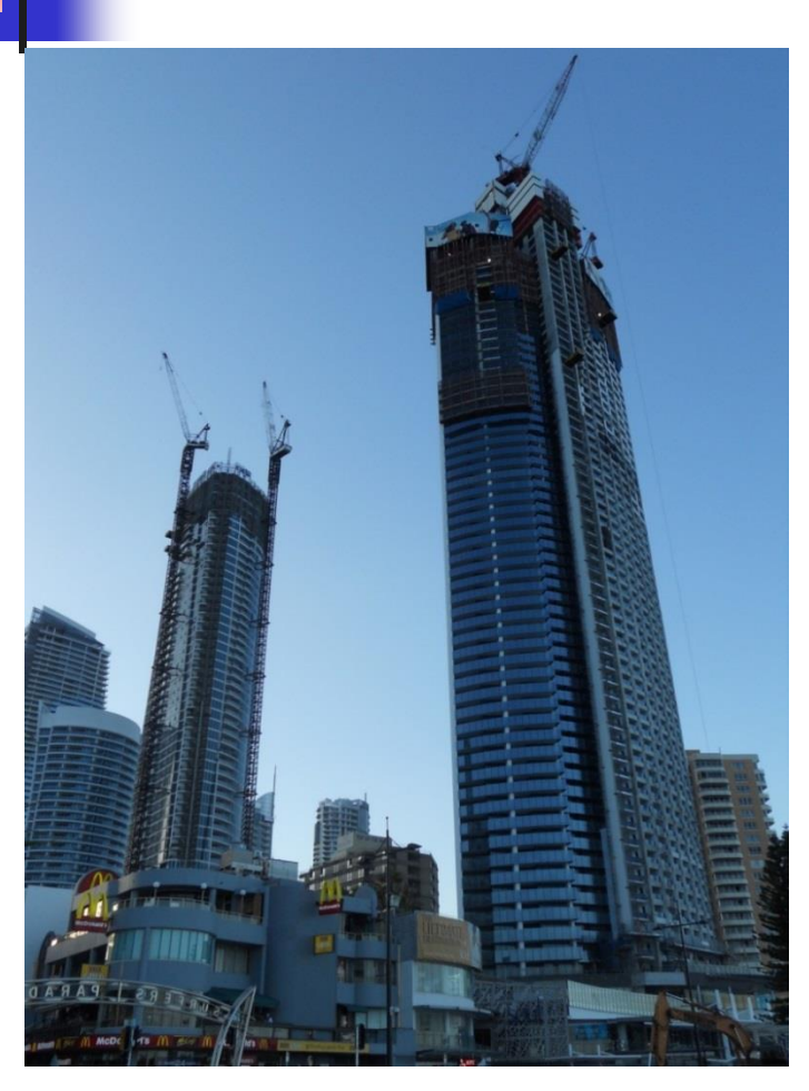
55 + storey apartments, Surfers Paradise, Gold Coast, Australia (Smallwood, 2011)