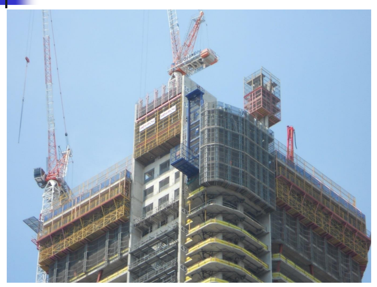
Tower cranes, Brisbane, Australia (Smallwood, 2011)